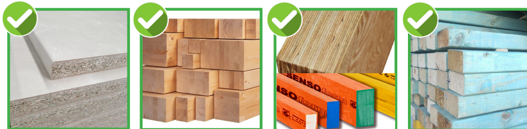
Laminated particleboard benchtop offcuts