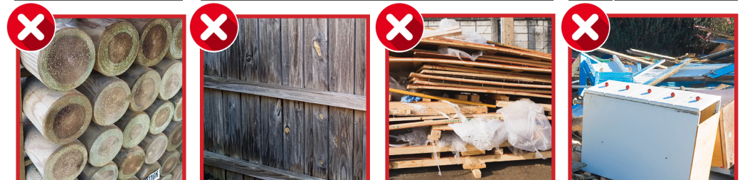
Koppers Logs & H4 timber