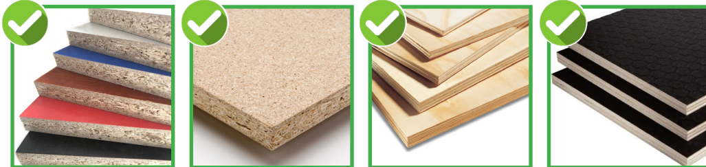
Melamine coated particleboard offcuts