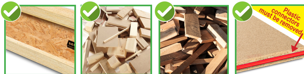
Oriented Strand Board (OSB)