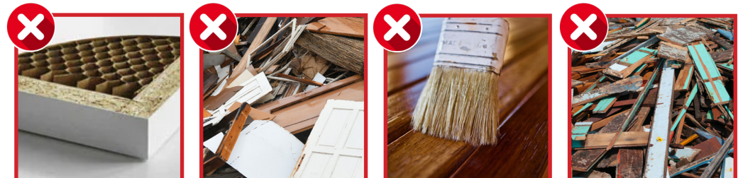
Furniture with honeycomb cardboard