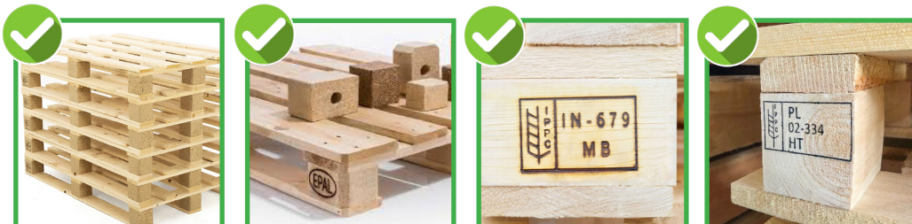
End of life (unpainted) pallets & dunnage